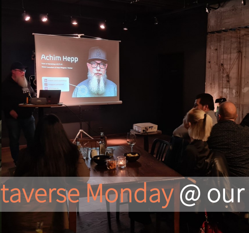
Moods of a Metaverse Monday @ our DNA destination Ruby Leni